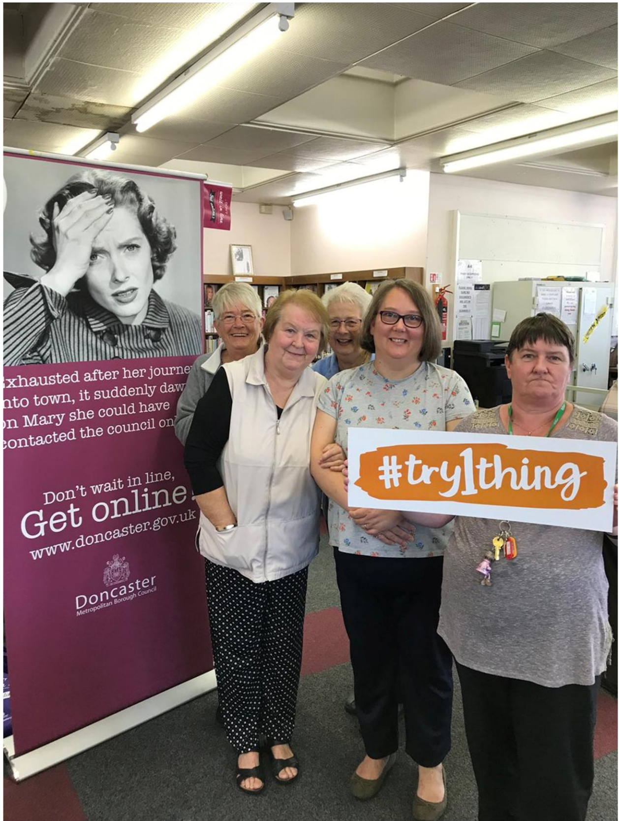
Photo: Volunteers at Scawthorpe Community Library promoting digital skills